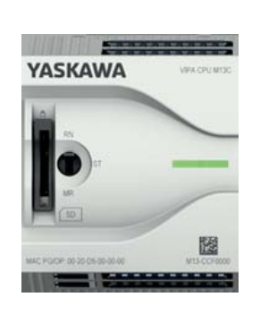
CPU M13C M13-CCF0000 PROFINET Controller